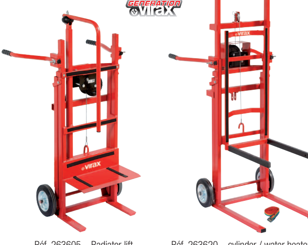
Réf. 263605 - Radiator lift