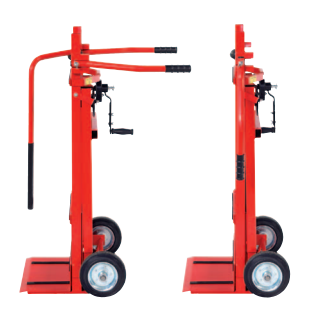
Folding handle and winch, practical for storage.