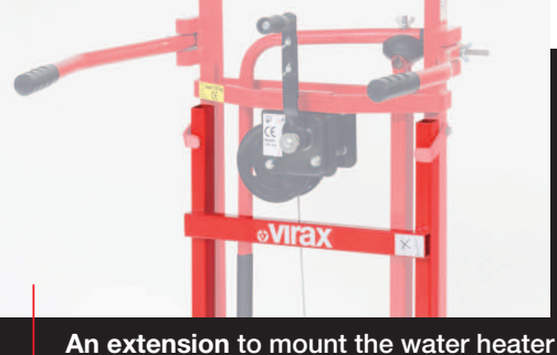
even higher or to adapt to vertical radiators.