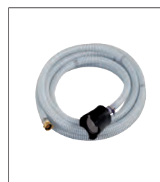
Suction filter screen