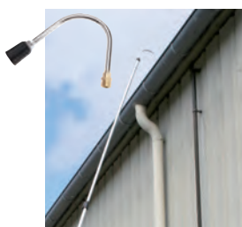
Gutter elbow lance