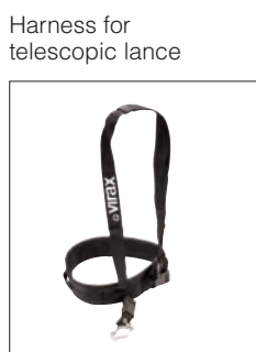
Harness for telescopic lance