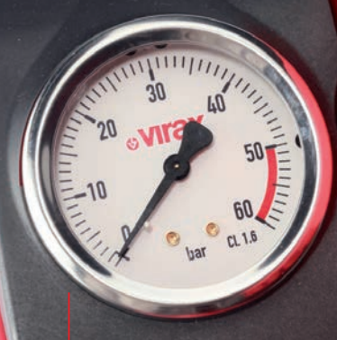
Manometer 50 bar