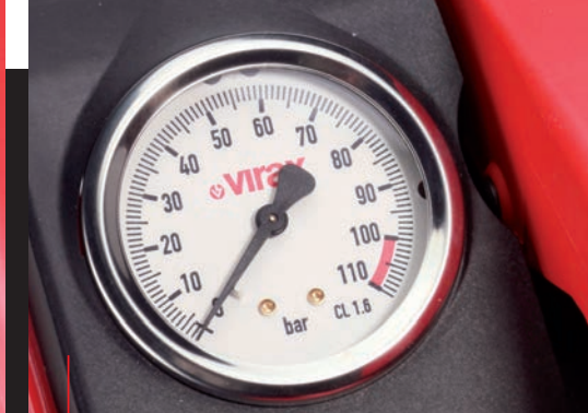
Manometer 100 bar