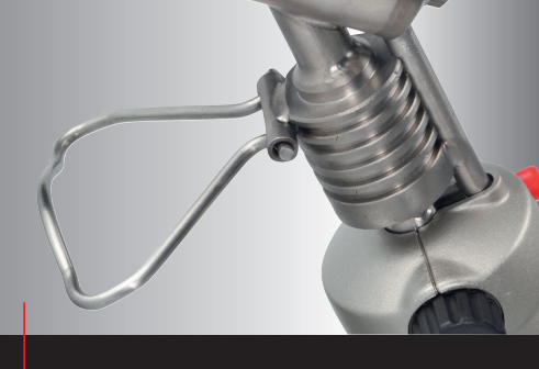
Handy with its folding support.