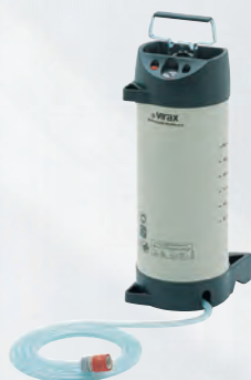
Manual water pump Réf. 050049