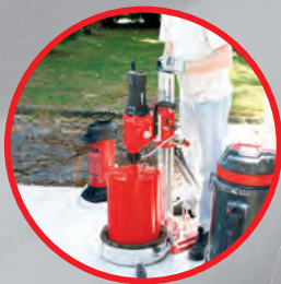
Vertical core drilling...