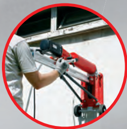
... and horizontal drilling.