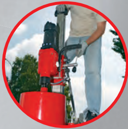
Power and safety: Motor with quadruple protection: thermal, mechanical, electronic and permanent gear lubrication system.