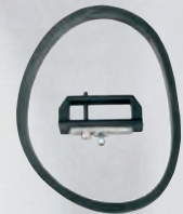
Support stand cover plate and seal