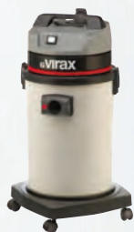
Water and dust vacuum cleaner Réf. 050057