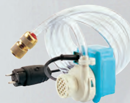
Electric water pump Réf. 050055