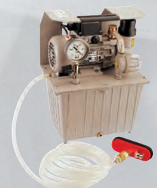
Vacuum pump Réf. 050043