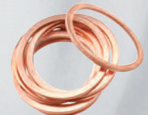
10 anti-lock washers.