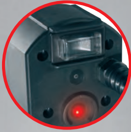
Core drilling control: Overload warning light.